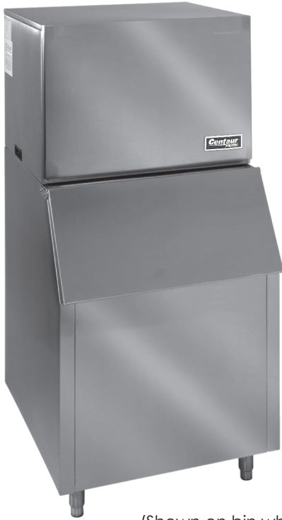
(Shown on bin which is not included)